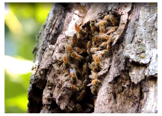
Figure 7. Link to video showing detail of washboarding behavior, showing the scraping of the surface by the front legs inward toward the mandibles in the repetitive activity (1700 hrs, 31.7°C). [https://www.youtube.com/ watch?v=1CbPYtDhYX4]. The tarsal pheromone sac is known to have no ducts and must be rubbed against a substrate to transfer the attractive pheromone to a surface. In addition to cleaning the site, perhaps this repetitive scraping serves to maintain a fresh layer of the tarsal "footprint" pheromone to aid returning foragers in quickly navigating to the nest entrance.

Also shown is the interruption of washboarding by one worker bee to expel another insect that has ventured too close, then the return of that bee to its previous position and resumption of the washboarding activity. While the washboarding activity appears stereotyped, worker bees may interrupt it at any time to perform other guard duties or to interact with colony mates.