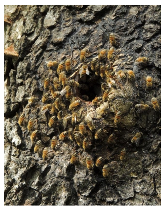
Figure 3. The first wild honey bee nest observed in a forest snag den at the Woodridge Public Use Area, Clinton Lake, KS, 29 July 2016, 1700 hrs, 30°C (UTM 15 S 288737, E 4311679). Note the vertical orientation of most workers, with the head down and abdomen up and raised off the surface in many bees. These bees were actively exibiting the stereotyped washboarding behavior around the opening to the hive.

surface in many individuals. These bees were actively engaged in the washboarding activity. In order to better illustrate the washboarding behavior I captured a video sequence (Fig. 4) with a small camera attached to a telescoping pole at the first nest site on 6 August 2016 (1800 hrs, 28°C). I visited this nest again on 12 August 2016 and discovered it was abandoned for unknown reasons.