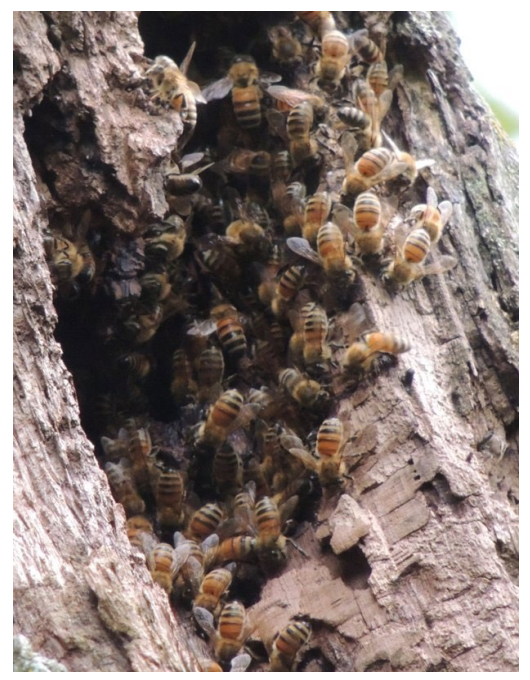
Figure 5. The second wild honey bee colony located in a mixed hardwood forest at Woodridge Park, Clinton Lake, KS, 8 September 2016, 1700 hrs, 30°C. (UTM 15 S 290338, E 4312546). These bees were also actively "washboarding," most with the head down, abdomen up and raised posture seen at the first site. The Nasonov gland at the tip of the abdomen emits an attractive, volatile set of chemicals that could possibly be better dispersed on the wind by this posture compared with a head-up posture in which some of the chemical might be absorbed by the body of the bee as it rose through the air.

bees will interrupt their activity to repel potential intruders, as well as to interact with other guards or returning foragers (as seen in Fig. 7). They also sometimes change position, moving around the nest entrance, often returning to a previous position to resume washboarding again.