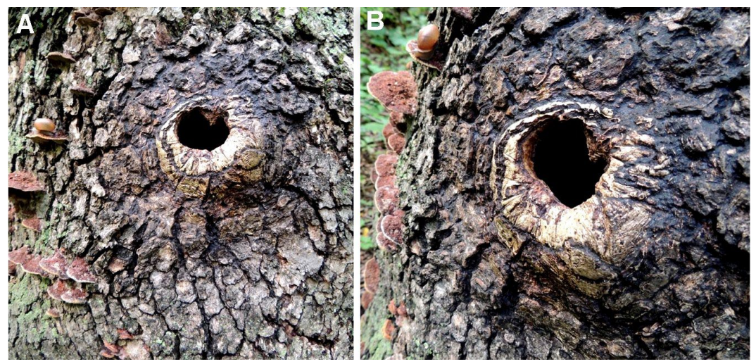
Figure 6a. At the abandoned first nest site the bark surface around the entrance where honey bees had been actively washboarding appears clean of moss and loose debris compared with surrounding untreated bark; Figure 6b. The surface of bark previously covered by mass of washboarding workers shows a smooth, waxy or oily appearance with a color tint not observed on surrounding untreated bark, suggesting the possibility of a residual presence of a chemical coating applied by the worker guards during their washboarding activity. The tarsal pheromone is described as an oily, non-volatile substance, that must be rubbed against a substrate to transfer the pheromone, and its possible repeated application during long bouts of washboarding around the nest entrance, may result in the difference in bark appearance there.

2003), and that washboarding bees also serve to clean the surface of debris (Bohrer and Pettis 2006). The utility of both the cleaning and guarding functions of washboarding bees is more apparent when the activities are observed at a natural hive compared with worker bees around the entrance to a box hive. The bark area around a natural hive entrance worked by bees is noticeably smoother and cleaner compared to the loose debris and moss that coat the adjacent bark surfaces of a dead tree. The entrance area of a natural tree cavity hive is also regularly visited by numerous other species that might pose a disturbance or threat to the colony, thus confirming the importance of a guarding function of the mass of workers around the hive entrance. Observations of the concentration of the washboarding workers around the single hive entrance of a natural cavity, with returning foragers passing through the center of the mass of washboarding bees as they dart into the hive, are also more suggestive that the workers may be producing attractive orienting pheromones to guide