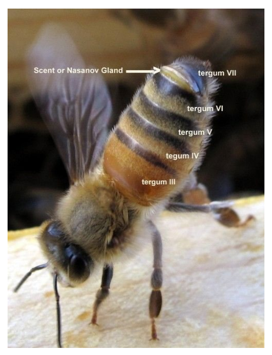
Figure 1. Honey bee posture during emission of pheromone from Nasonov gland at upper tip of abdomen. Photo by Pollinator, April 2003, South Carolina.

Bees also possess a tarsal gland which produces a so-called "footprint" pheromone, which is stored in a sac at the base of the last tarsal segment (Collins 2015; Fig. 2). The footprint pheromone also functions as an attractant to foraging bees (Ribbands 1954), but its storage sac is unusual in having no ducts whereby the pheromone can be secreted to the environment. The mode of transfer of the chemical from the storage sac to a substrate is unknown (Bartolloti and Costa 2014), but it